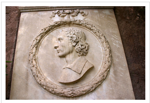
Relief on wall near his grave in Rome

When Keats died at 25, he had been writing poetry seriously for only about six years, from 1814 until the summer of 1820; and publishing for only four. In his lifetime, sales of Keats's three volumes of poetry probably amounted to only 200 copies. His first poem, the sonnet O Solitude appeared in the Examiner in May 1816, while his collection Lamia, Isabella, The Eve of St. Agnes and other poems was published in July 1820 before his last visit to Rome. The compression of his poetic apprenticeship and maturity into so short a time is just one remarkable aspect of Keats's work. [1]